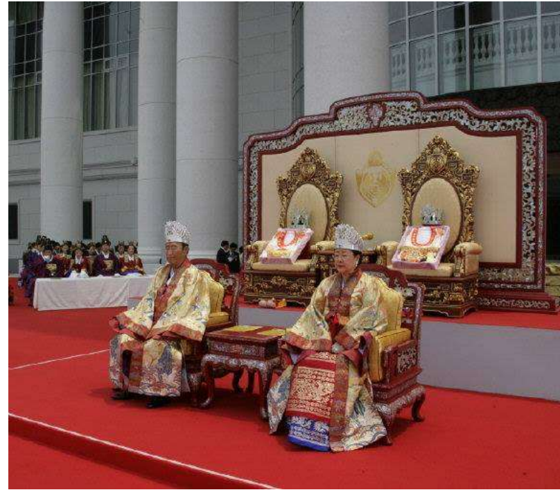
Entrance Ceremony into the Cheon Jeong Gung and Coronation of True Parents as King and Queen of Cosmic Peace (June 13, 2006)