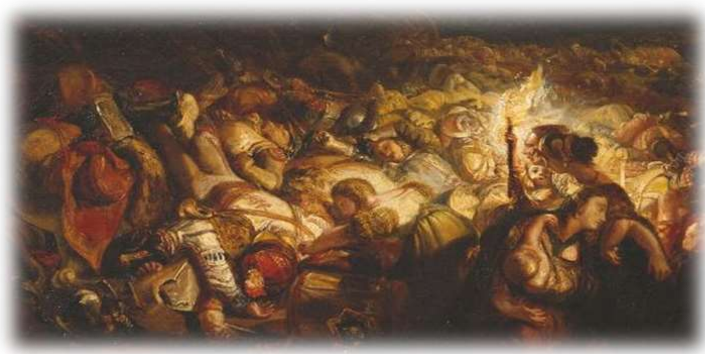
"The Field at Waterloo" by Joseph Turner